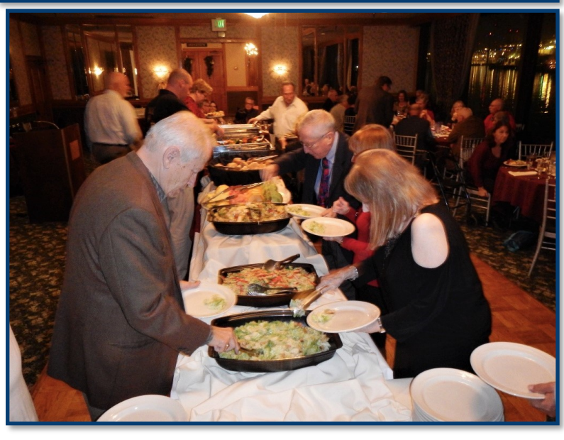
Photos: Scenes from previous PVARC Holiday Dinners at Ports O'Call Restaurant in the upstairs Breakwater Room.