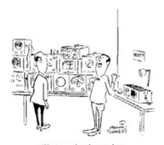
"My transceiver is over here. That's just my testing equipment."

So, I ask, how important is Field Day to the membership of the PVARC? Important enough for someone new to take the helm? How about YOU?