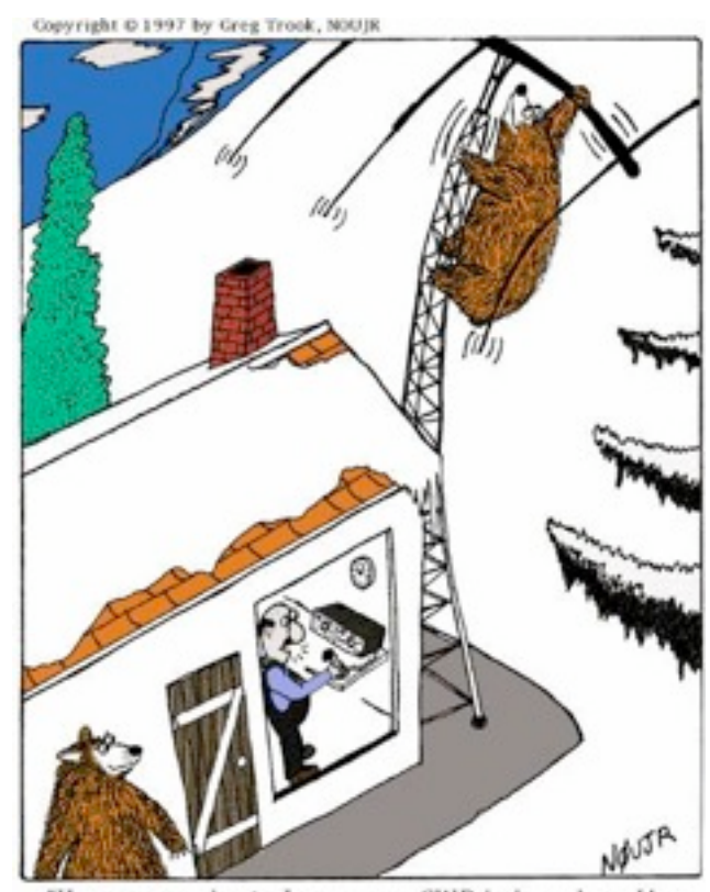
"Hang on a minute Larry...my SWR is jumping...I'm going outside and see what the problem is..."